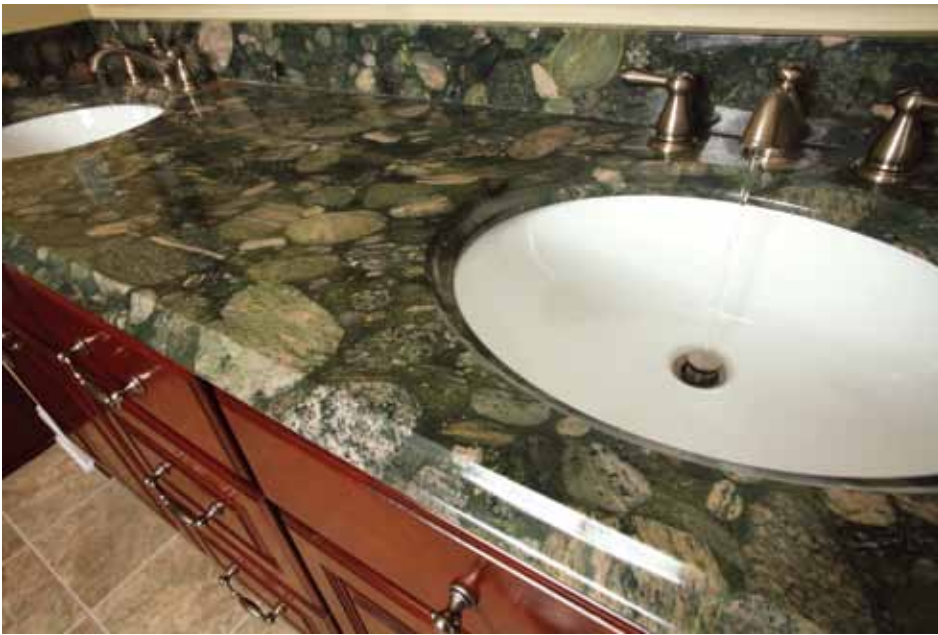
This double bowl bath vanity showcases Ogee edgework in Verde Marinaci granite.

we are now able to offer the fastest and most reliable turnaround time in the area.”