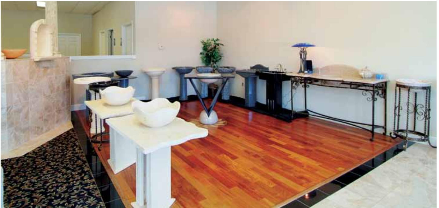
The stone accessory showroom for Grassie Granite & Marble displays fountains, pedestal sinks, benches, metal work and much more.

Granite & Marble, Inc., but the company is continuing to do business as Grassie Granite & Marble.